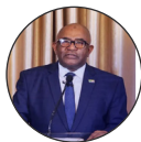
Azali Assoumani President of Comoros

Ultimately, the Comoros will be equipped with two key tools to fundamentally change the face of its urbanization: a new Urban Planning and Construction Code, and the National Urban Planning and Habitat Policy (PNUH) and its implementation plan.